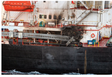
NS Visakhapatnam swiftly responded to a distress call

In a swift operation, a guided missile destroyer of the Indian Navy intercepted a cargo vessel with 22 crew members, including nine Indians, little over an hour after the Marshall Island-flagged ship came under a drone strike in the Gulf of Aden on Wednesday night.